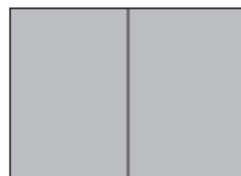
Spread 420 x 297 mm