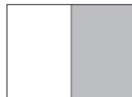
Full page 210 x 297 mm