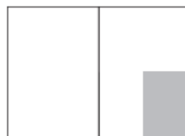
1/4 page 102x 146 mm